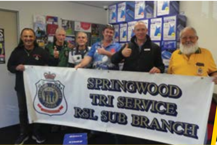
Springwood Tri Services