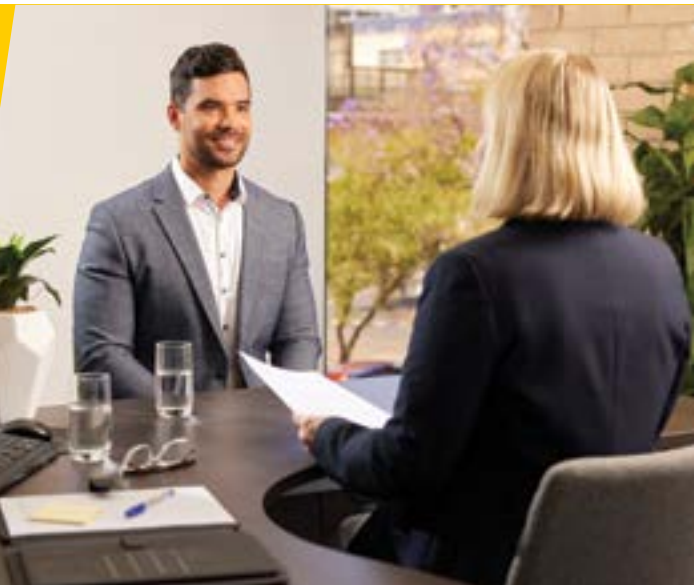
RSL Employment Program