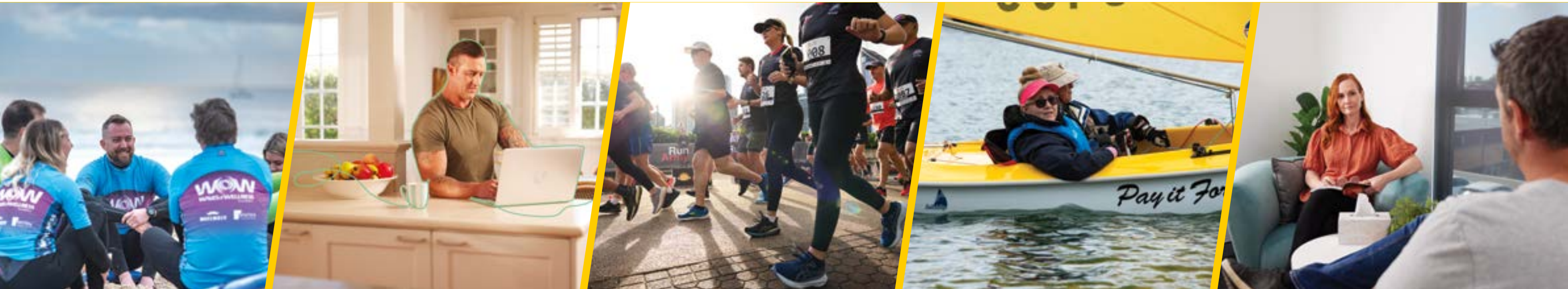
Waves of Wellness

Four desistance programs were delivered in Townsville, Wolston Correctional, Lotus Glen and Maryborough, with program feedback highlighting consistent self-reporting of improved mindset among participants.