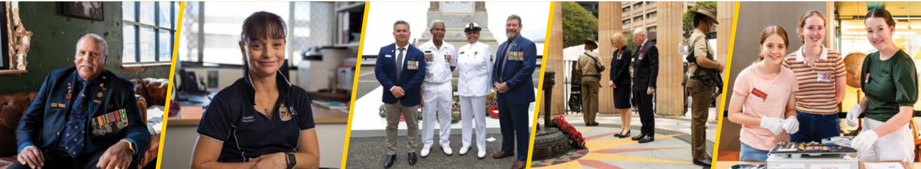
Vietnam Veterans' Day

2024 Premier’s Anzac Prize student recipient