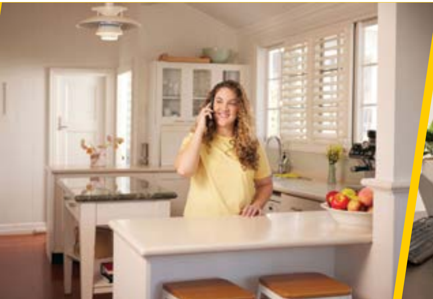
Education and Skills Program Pilot